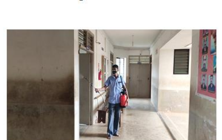
Sanitising the school premises