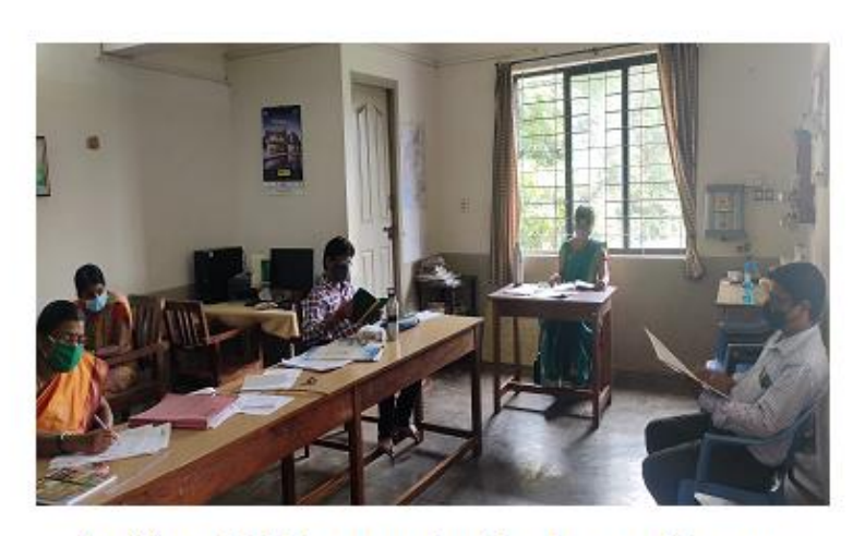
Staff social distance inside the staff room